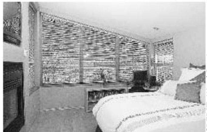
Master bedroom with space for a small office & a deck with a view overlooking English Bay.